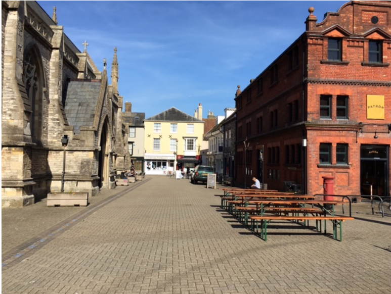
1. Proposed location and proposed street furniture

Below is an example of the outdoor area that we looking to achieve with white picket fencing and astro turf and planters. We believe this is in keeping with the local area and will benefit in bringing more people to the square and offering a proper enclosed al fresco experience.